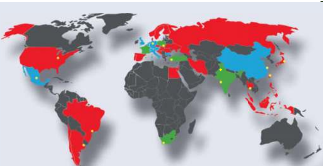
● Production Locations around the world.